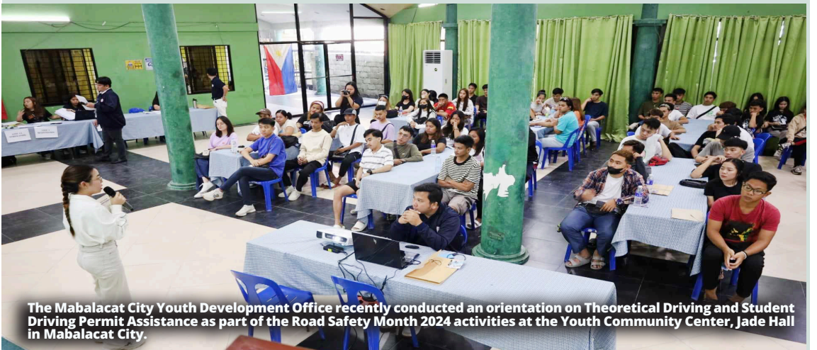
The Mabalacat City Youth Development Office recently conducted an orientation on Theoretical Driving and Student Driving Permit Assistance as part of the Road Safety Month 2024 activities at the Youth Community Center, Jade Hall in Mabalacat City.

She encouraged them to take advantage of the resources and support provided by the city government to enhance their driving skills and contribute to building a more secure and responsible community.