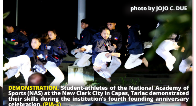
DEMONSTRATION. Student-athletes of the National Academy of Sports (NAS) at the New Clark City in Capas, Tarlac demonstrated their skills during the institution's fourth founding anniversary celebration.