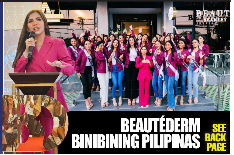
BEAUTÉDERM BINIBINING PILIPINAS SEE BACK PAGE