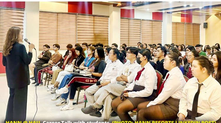
HANN @ HAU. Career Talk with students.

Hann Resorts was introduced to fourth-year students of the School of Hospitality and Tourism Management (SHTM), where we promoted the company as the employer of choice, provided career guidance, and discussed professional ethics in the workplace. SEE PAGE 4 HANN HOSTS