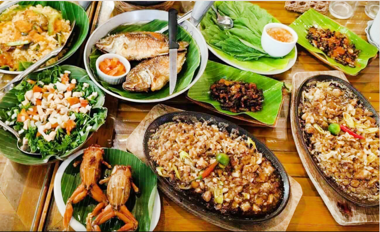
SUPPORT ANGELES CITY. The Department of Tourism-Central Luzon (DOT-3) urges the public to support Angeles City’s bid in the World Culinary Awards under the “Asia’s Best Emerging Culinary City Destination” category. (PIA 3)

Under the category for Asia, voters may find and click on Asia’s Best Emerging Culinary City Destination 2024, then select Angeles City, Pampanga (Philippines) to cast their vote. (PIA REGION 3-PAMPANGA)