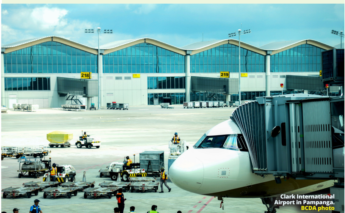
Clark International Airport in Pampanga.