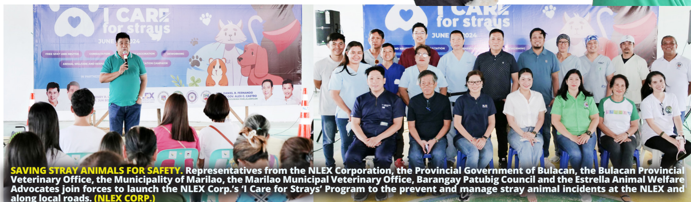
SAVING STRAY ANIMALS FOR SAFETY. Representatives from the NLEX Corporation, the Provincial Government of Bulacan, the Bulacan Provincial Veterinary Office, the Municipality of Marilao, the Marilao Municipal Veterinary Office, Barangay Patubig Council and the Estrella Animal Welfare Advocates join forces to launch the NLEX Corp.’s ‘I Care for Strays’ Program to the prevent and manage stray animal incidents at the NLEX and along local roads.