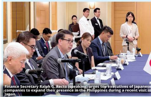
Finance Secretary Ralph G. Recto (speaking) urges top executives of Japanese companies to expand their presence in the Philippines during a recent visit in Japan.