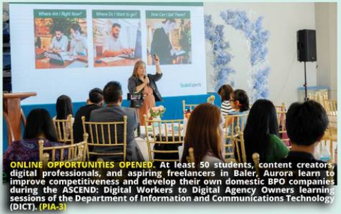
ONLINE OPPORTUNITIES OPENED. At least 50 students, content creators, digital professionals, and aspiring freelancers in Baler, Aurora learn to improve their own domestic BPO companies during the ASCEND: Digital Workers to Digital Agency Owners learning sessions of the Department of Information and Communications Technology (DICT).

Since 2017, the DICT has been enabling online freelancing by implementing a number of programs which include Rural Impact Sourcing, Digital Jobs Training, and freelancing opportunities through EDGE PH. (PIA REGION 3-AURORA)