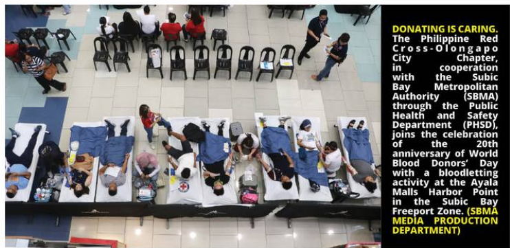
DONATING IS CARING. The Philippine Red Cross - Olongapo City Chapter, in cooperation with the Subic Bay Metropolitan Authority (SBMA) through the Public Health and Safety Department (PHSD), joins the celebration of the 20th anniversary of World Blood Donors' Day with a bloodletting activity at the Ayala Malls Harbor Point in the Subic Bay Freeport Zone.