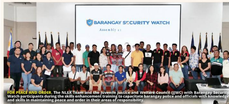
FOR PEACE AND ORDER. The NLEX Team and the Juvenile Justice and Welfare Council (JJWC) with Barangay Security Watch participants during the skills enhancement training to capacitate barangay police and officials with knowledge and skills in maintaining peace and order in their areas of responsibility.

This year's World Day against Child Labor observance has the theme "Let's Act on Our Commitments: End Child Labor" while the national theme is "Bawat Bata, Malaya: Mithin ng Nagkakaisang Bangsa." (PIA-REGION 3, TARLAC)