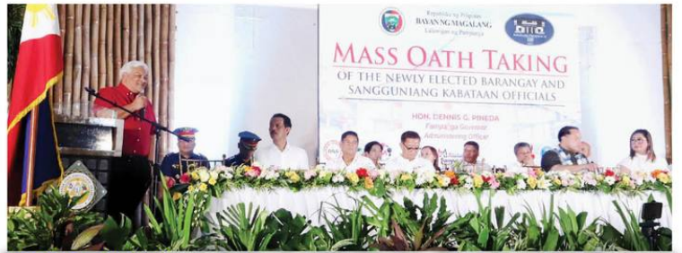
EYES ON THE FIRST DISTRICT: Angeles City Mayor Carmelo "Pogi" Lazatin Jr. addresses the newly-elected Barangay and Sangguniang Kabataan officials of the Municipality of Magalang during their Mass Oath-Taking on November 13, 2023 upon the invitation of Magalang Mayor Malu Lacson. Pampanga Governor Dennis "Delta" Pineda administered the oath