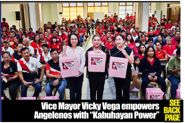
Vice Mayor Vicky Vega empowers Angelenos with "Kabuhayan Power" SEE BACK PAGE