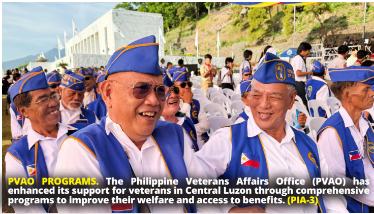
PVAO PROGRAMS. The Philippine Veterans Affairs Office (PVAO) has enhanced its support for veterans in Central Luzon through comprehensive programs to improve their welfare and access to benefits.

Application forms for PVAO's various programs are available for download on their website at www.pvao.gov.ph . (PIA REGION 3-PAMPANGA)