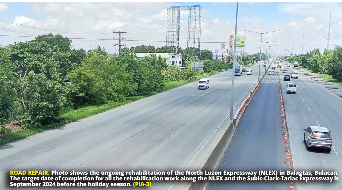
ROAD REPAIR. Photo shows the ongoing rehabilitation of the North Luzon Expressway (NLEX) in Balagtas, Bulacan. The target date of completion for all the rehabilitation work along the NLEX and the Subic-Clark-Tarlac Expressway is September 2024 before the holiday season. (PIA-3)