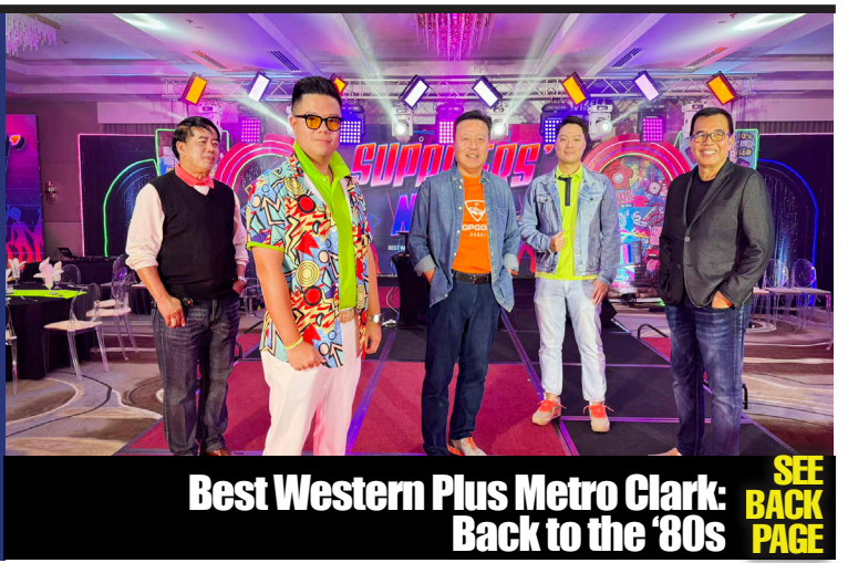
Best Western Plus Metro Clark: Back to the '80s SEE BACK PAGE