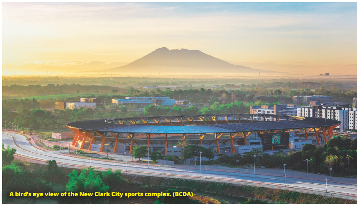
A bird's eye view of the New Clark City sports complex.