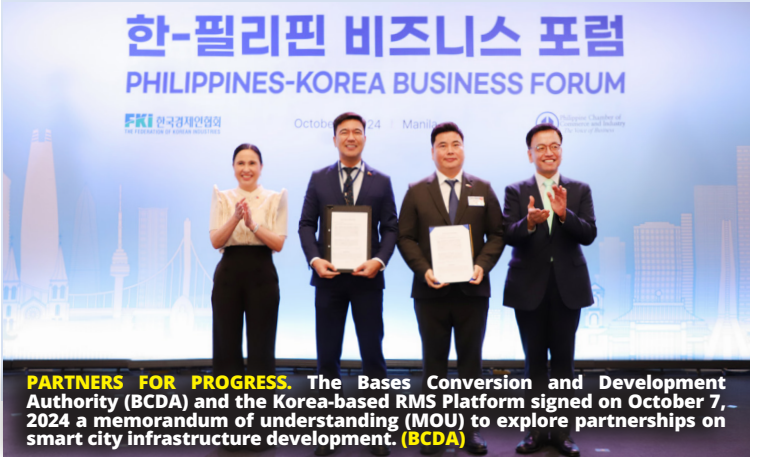
PARTNERS FOR PROGRESS. The Bases Conversion and Development Authority and the Korea-based RMS Platform signed on October 7, 2024 a memorandum of understanding (MOU) to explore partnerships on smart city infrastructure development.