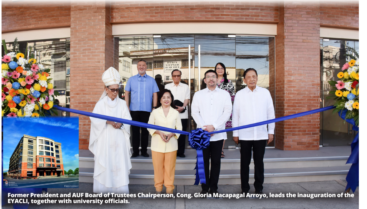
Former President and AUF Board of Trustees Chairperson, Cong. Gloria Macapagal Arroyo, leads the inauguration of the EYACLI, together with university officials.