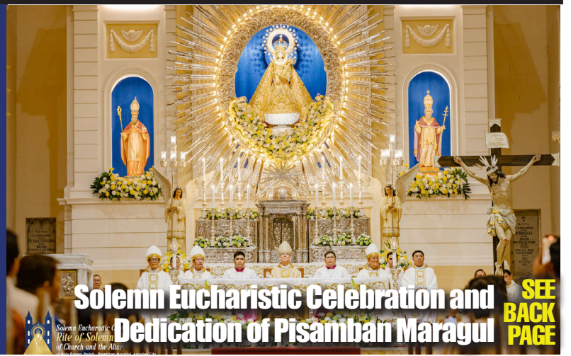
Solemn Eucharistic Celebration and Dedication of Pisamban Maragul