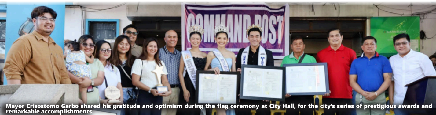
Mayor Crisostomo Garbo shared his gratitude and optimism during the flag ceremony at City Hall, for the city’s series of prestigious awards and remarkable accomplishments.

Mabalacat City’s accomplishments in 2024 serve as a shining example of what can be achieved through dedication, teamwork, and the unwavering commitment to excellence.