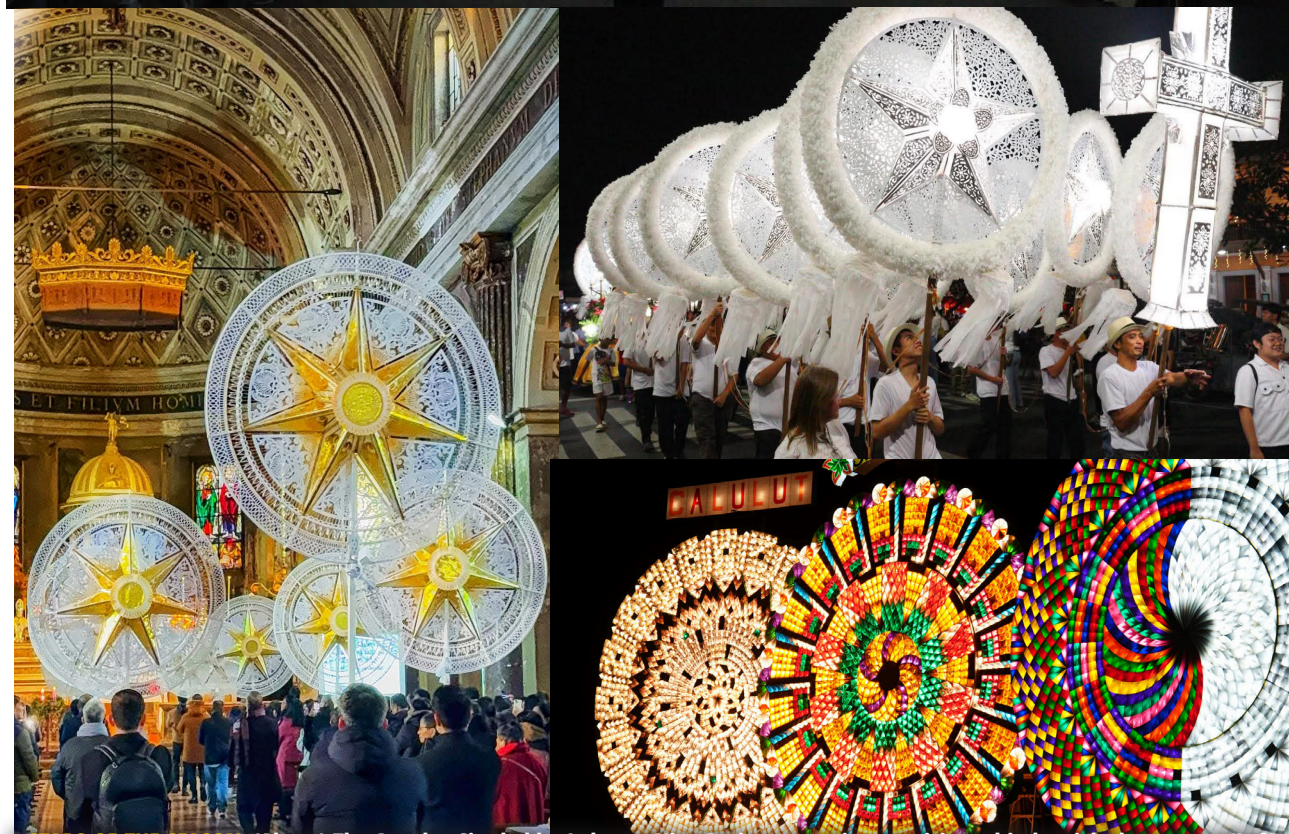
STARS OF THE SEASON. (Above) The Angeles City held a Lubenas Ning Pasku procession, participated in by eight barangays. (Left, below) Lubenas from Magalang town made an appearance abroad for the first time in Italy, where they were showcased during the first Simbang Gabi for the year at the Basilica di Sto. Stefano Maggiore in Milan. (Below right) Participants in the recent Ligligan Parul in the City of San Fernando.