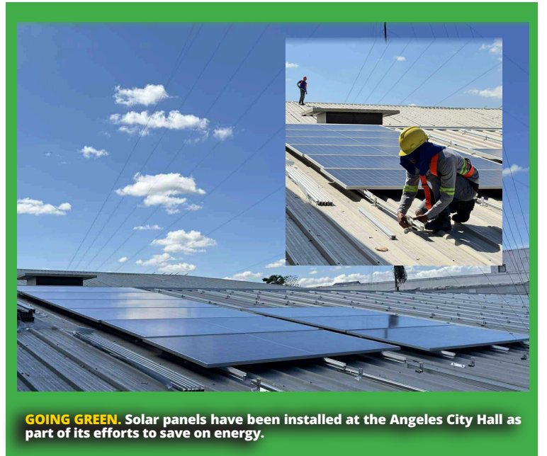
GOING GREEN. Solar panels have been installed at the Angeles City Hall as part of its efforts to save on energy.