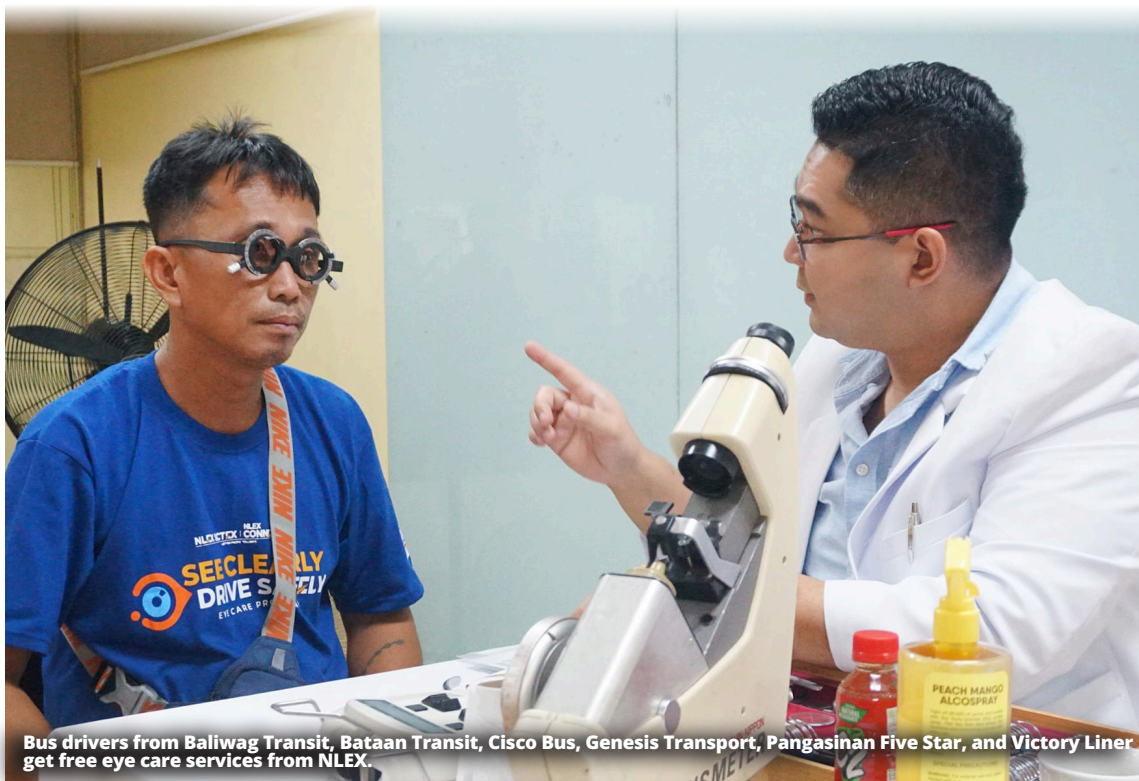
Bus drivers from Baliwag Transit, Bataan Transit, Cisco Bus, Genesis Transport, Pangasinan Five Star, and Victory Liner get free eye care services from NLEX.

Since its inception, the program has benefitted nearly 1,000 transport drivers, reinforcing NLEX's commitment to enhancing road safety through good eyesight.