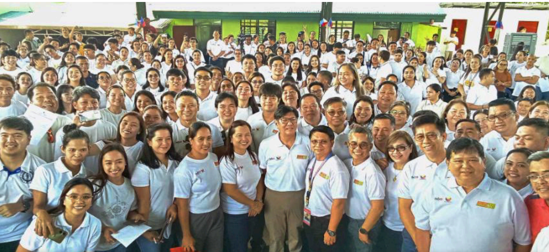
President Ferdinand R. Marcos Jr. leads the kick-off ceremony of Brigada Eskwela 2025 at Tibagan Elementary School in San Miguel, Bulacan.