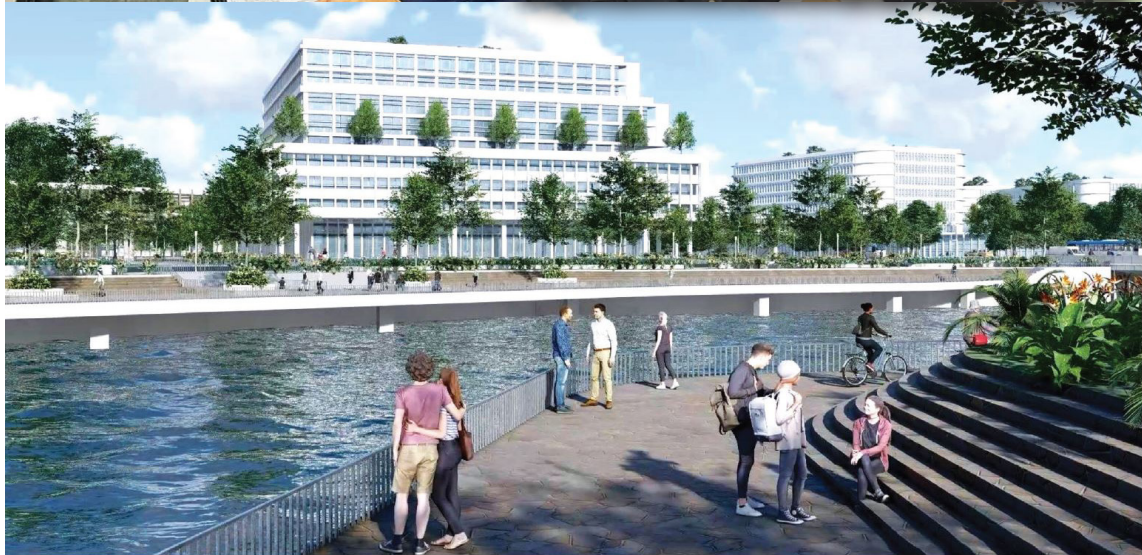
The Dolores Riverpark is envisioned as a sustainable river esplanade grounded on rainwater and wastewater recycling management systems, effectively fostering sustainability and biodiversity in the area while creating a more aesthetically pleasing and welcoming space.