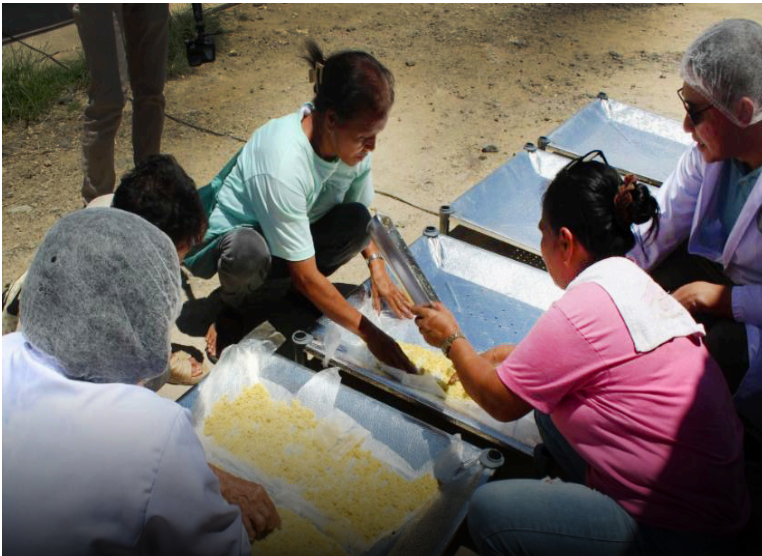
The Department of Science and Technology promotes the use of renewable energy for livelihood development through hands-on food processing training in Dipaculao, Aurora. A total of 43 members from various local associations were trained to use solar-powered equipment to support sustainable, typhoon-resilient income sources. (DOST)

The equipment was procured in partnership with the Aurora State College of Technology who also helped identify the most suitable tools for the community. Among the products now being processed are dried and smoked fish, fish sardines, kamote fries, kamote chips, and kamote powder—enhancing product quality, extending shelf life, and improving market value. “By shifting to solar-powered technologies, we’re not only cutting production costs but also helping communities build more resilient and sustainable livelihoods,” Agumboy emphasized. Meanwhile, DOST continues to implement science-based programs in Aurora to strengthen local industries by enhancing productivity, promoting innovation, and supporting long-term economic growth. These include the Manufacturing Productivity Program which provides technical consultancy to improve efficiency in micro, small, and medium enterprises; and the Small Enterprise Technology Upgrading Program which supports the adoption of innovative technologies in business operations.