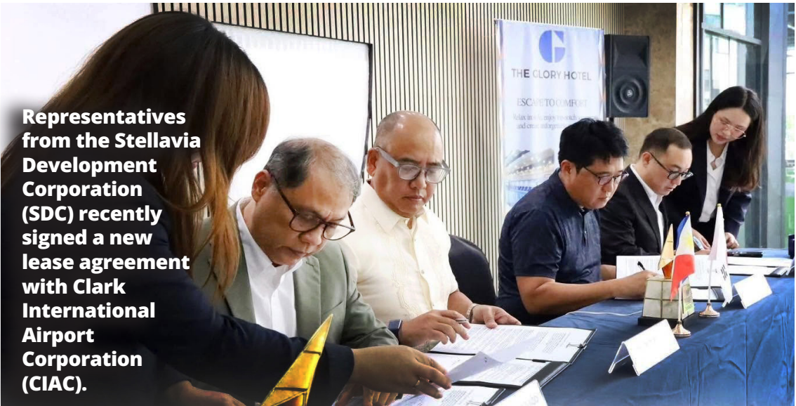
Representatives from the Stellavia Development Corporation (SDC) recently signed a new lease agreement with Clark International Airport Corporation (CIAC).

— just minutes from Clark International Airport. Included in the development plan are a new cascade feature, access road, cafeteria, and additional parking area, all designed to elevate guest experience and meet the growing demands of clientele. The move further solidifies Clark's reputation as a rising hub for hospitality and tourism investment in Central Luzon.