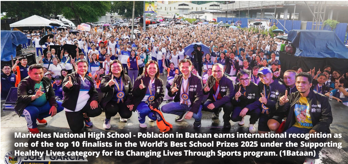
Mariveles National High School - Poblacion in Bataan earns international recognition as one of the top 10 finalists in the World’s Best School Prizes 2025 under the Supporting Healthy Lives category for its Changing Lives Through Sports program.