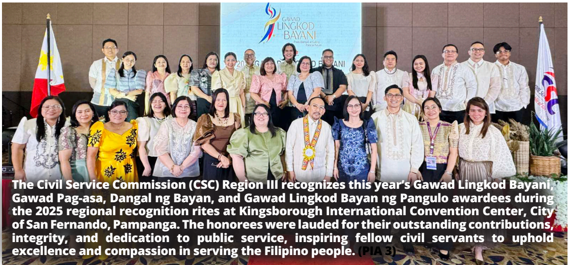
The Civil Service Commission (CSC) Region III recognizes this year's Gawad Lingkod Bayani, Gawad Pag-asa, Dangal ng Bayan, and Gawad Lingkod Bayan ng Pangulo awardees during the 2025 regional recognition rites at Kingsborough International Convention Center, City of San Fernando, Pampanga. The honorees were lauded for their outstanding contributions, integrity, and dedication to public service, inspiring fellow civil servants to uphold excellence and compassion in serving the Filipino people.