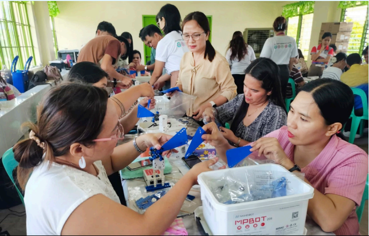
About 11 schools in Aurora receive robotics kits from the Department of Science and Technology, providing students with hands-on exposure to science, technology, engineering, and mathematics.

Through these initiatives, DOST seeks to empower communities by building a stronger foundation for inclusive learning and sustainable development, ensuring that innovation reaches even the most underserved areas.