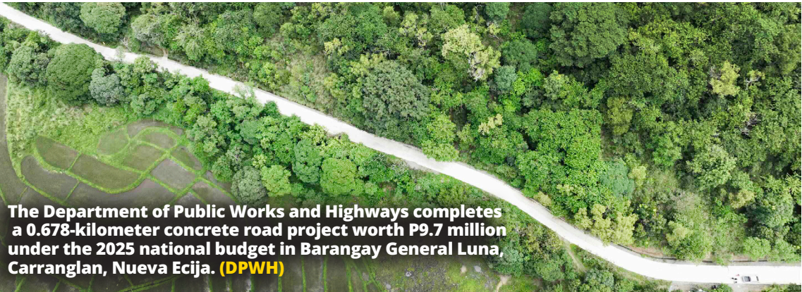
The Department of Public Works and Highways completes a 0.678-kilometer concrete road project worth P9.7 million under the 2025 national budget in Barangay General Luna, Carranglan, Nueva Ecija.

The project supports the infrastructure drive of President Ferdinand R. Marcos Jr. to improve mobility, reduce isolation in remote areas, and strengthen the delivery of essential services.