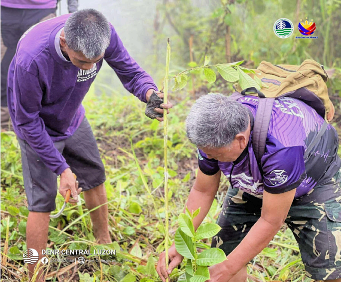
The Department of Environment and Natural Resources, through its community office in Tarlac, continues to boost forest protection with sustained tree planting and nurturing activities at the Arboretum in San Clemente town. (DENR)

Established in June 2023 at no cost to the government, the project is made possible through the active participation of local stakeholders.