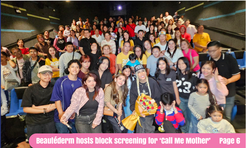
Beautéderm hosts block screening for 'Call Me Mother' Page 6