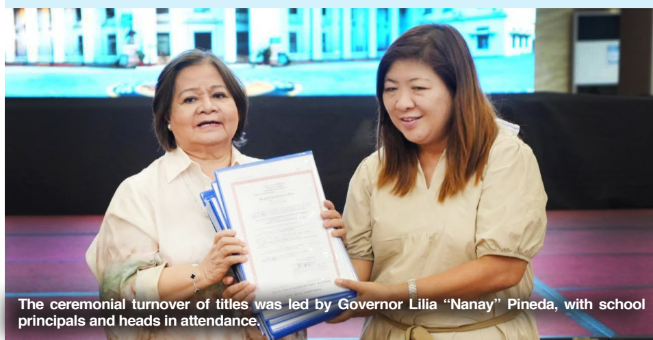
The ceremonial turnover of titles was led by Governor Lilia “Nanay” Pineda, with school principals and heads in attendance.