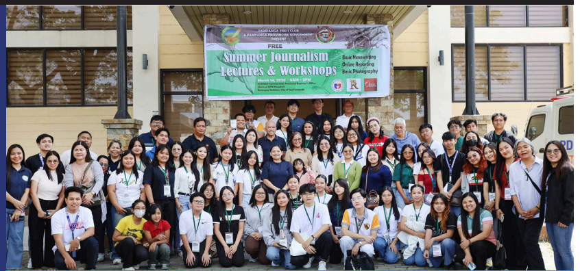
PPC trains 100 campus writers in Pampanga