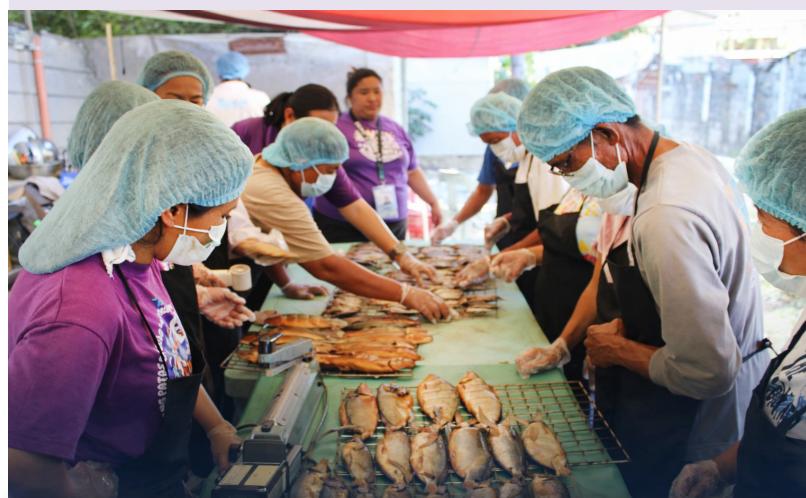
Members of the Samahan ng Mangingisda at Magsasaka ng Nampicuan participate in a hands-on fish smoking training by the Bureau of Fisheries and Aquatic Resources Regional Office III – Special Area for Agricultural Development Program Phase II in Nampicuan, Nueva Ecija.

Through these training activities, BFAR continues to equip fisherfolk and farmers with the skills, facilities, and support to grow their livelihoods, strengthen the local fisheries industry, and achieve sustainable income.