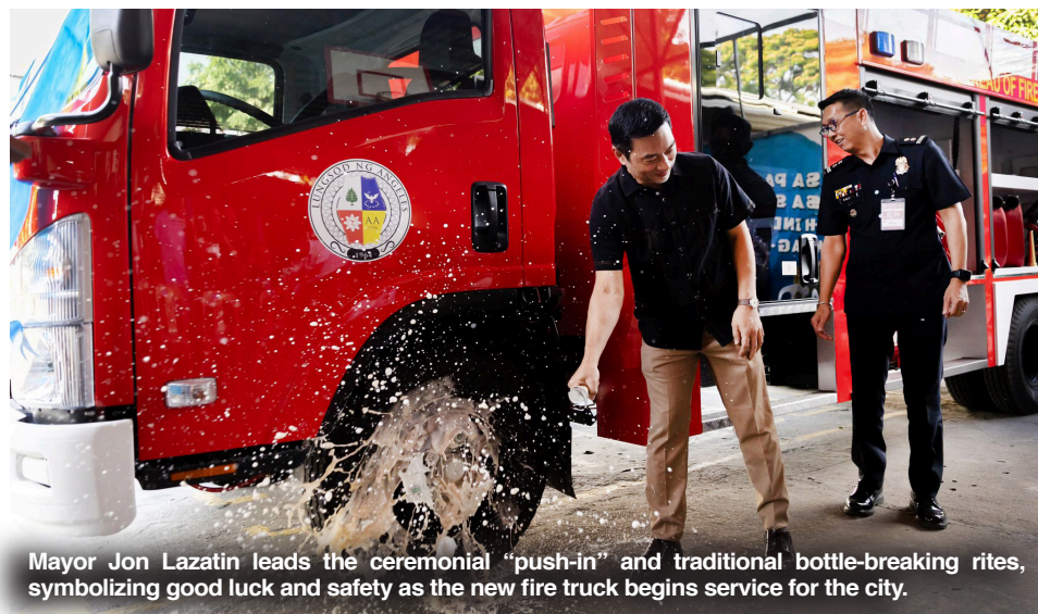
Mayor Jon Lazatin leads the ceremonial “push-in” and traditional bottle-breaking rites, symbolizing good luck and safety as the new fire truck begins service for the city.

With the addition of the new fire truck, Angeles City continues to enhance its readiness to respond swiftly and effectively to emergencies, ensuring the safety and well-being of all Angeleños.