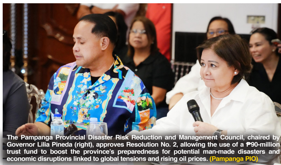
The Pampanga Provincial Disaster Risk Reduction and Management Council, chaired by Governor Lilia Pineda (right), approves Resolution No. 2, allowing the use of a P90-million trust fund to boost the province’s preparedness for potential man-made disasters and economic disruptions linked to global tensions and rising oil prices.