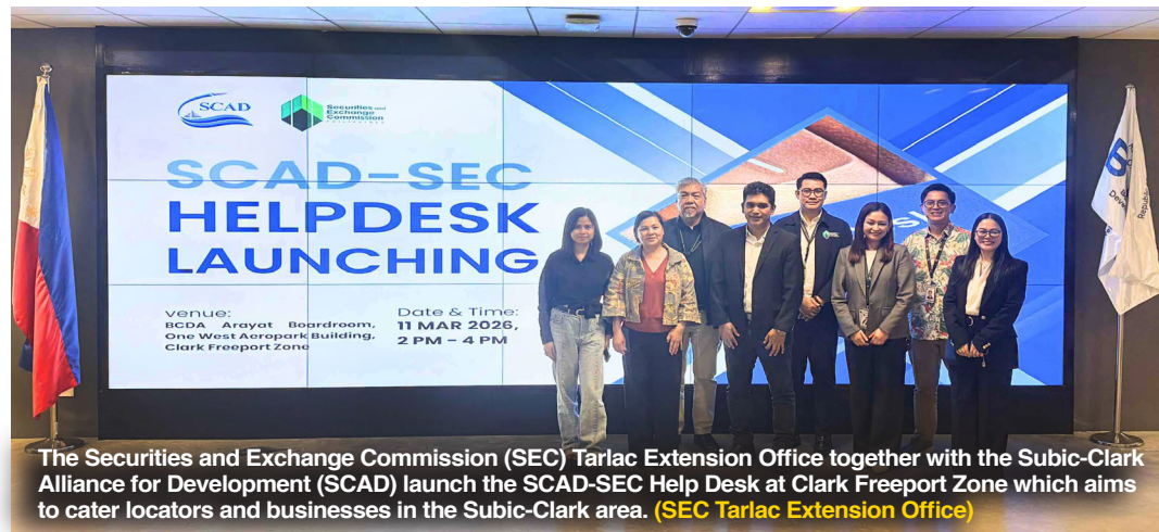
The Securities and Exchange Commission (SEC) Tarlac Extension Office together with the Subic-Clark Alliance for Development (SCAD) launch the SCAD-SEC Help Desk at Clark Freeport Zone which aims to cater locators and businesses in the Subic-Clark area.

TARLAC CITY — The Securities and Exchange Commission (SEC) Tarlac Extension Office (TAREO) and the Subic-Clark Alliance for Development (SCAD) have provided an expanded and more convenient channel to deliver regulatory services in Subic-Clark corridor through the launching of the SCAD-SEC Help Desk.