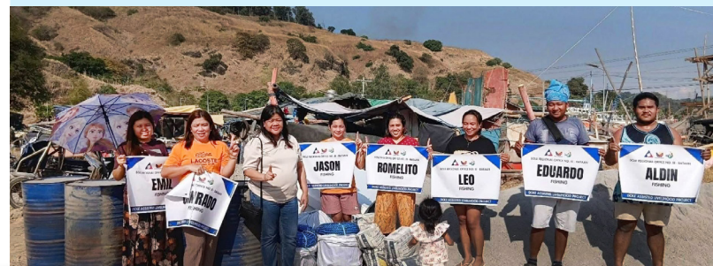
Seven fisherfolk from Barangay Sisiman in Mariveles, Bataan, receive raw materials from the Department of Labor and Employment to produce buoys, helping them earn a steady income while practicing responsible fishing.

DOLE's livelihood programs form part of the national government's broader effort to boost local industries, enhance the quality of life of Filipino workers, and promote sustainable economic growth in communities.