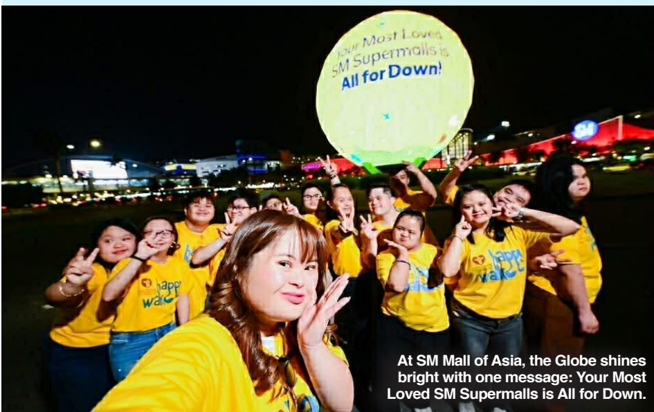
At SM Mall of Asia, the Globe shines bright with one message: Your Most Loved SM Supermalls is All for Down.