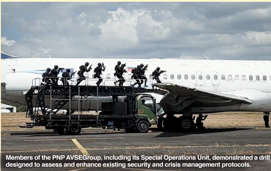
Members of the PNP AVSEGroup, including its Special Operations Unit, demonstrated a drill designed to assess and enhance existing security and crisis management protocols.

CLARK FREEPORT — The Clark International Airport (CRK) conducted its first full-scale security exercise, simulating an aircraft hijacking scenario to test emergency response capabilities and inter-agency coordination.