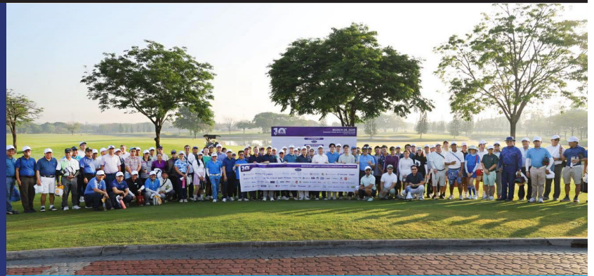
Swings, cheers, and champions shine at 10th SGH Golf Cup 2026 P6