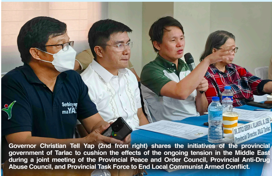
Governor Christian Tell Yap (2nd from right) shares the initiatives of the provincial government of Tarlac to cushion the effects of the ongoing tension in the Middle East during a joint meeting of the Provincial Peace and Order Council, Provincial Anti-Drug Abuse Council, and Provincial Task Force to End Local Communist Armed Conflict.

With the ongoing tension affecting the country, the Provincial Government of Tarlac committed to providing full support and assistance not only to its employees, transport groups, and OFWs, but to all sectors affected by the situation.