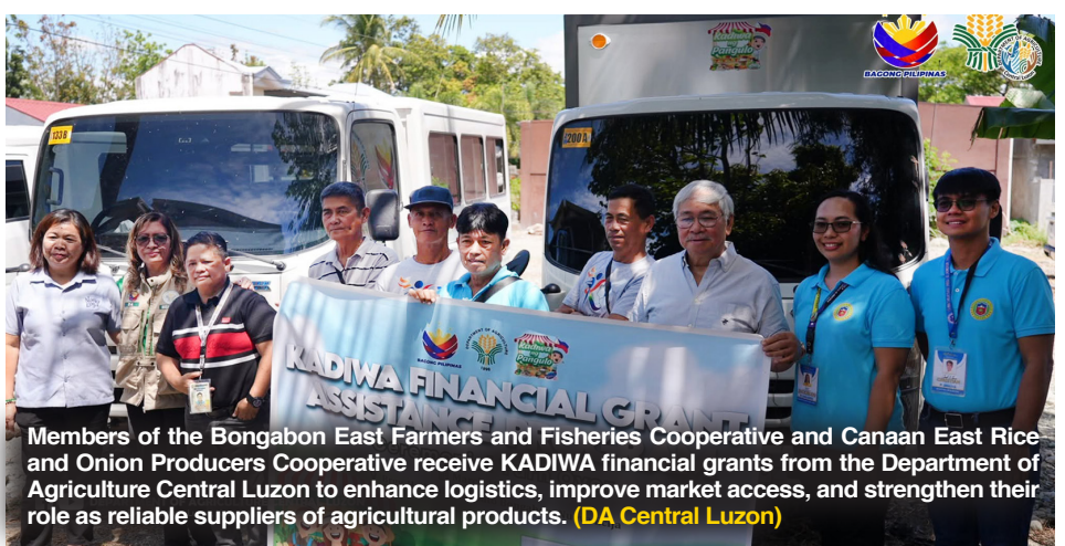
Members of the Bongabon East Farmers and Fisheries Cooperative and Canaan East Rice and Onion Producers Cooperative receive KADIWA financial grants from the Department of Agriculture Central Luzon to enhance logistics, improve market access, and strengthen their role as reliable suppliers of agricultural products. (DA Central Luzon)