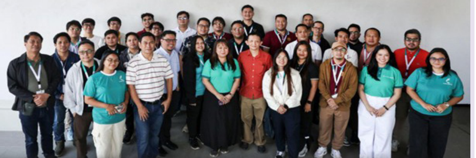
Three-day immersion in the Converge Angeles Data Center Tier III facility advances the growing collaboration under the UP–Converge MOU, structured around the UP OVPDx Data Center Staff Competency Framework

a working data center, learning from the engineers, executives, and professionals who operate it every day. That is how we build real institutional capability — not through frameworks on paper, but through practice.”