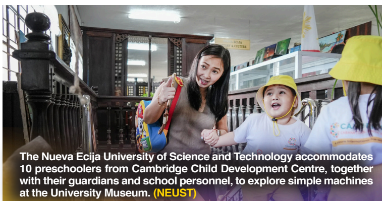
The Nueva Ecija University of Science and Technology accommodates 10 preschoolers from Cambridge Child Development Centre, together with their guardians and school personnel, to explore simple machines at the University Museum.

The activity showcases NEUST facilities bringing simple machines lessons to life for preschoolers through hands-on exploration.