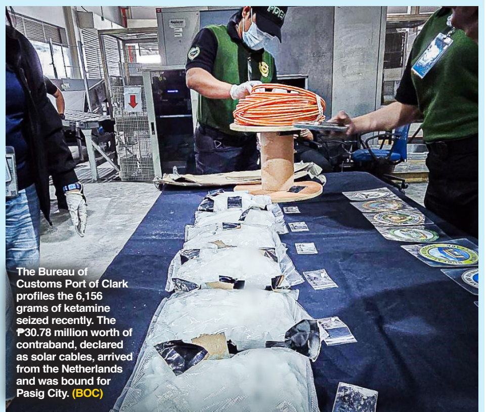
The Bureau of Customs Port of Clark profiles the 6,156 grams of ketamine seized recently. The ₱30.78 million worth of contraband, declared as solar cables, arrived from the Netherlands and was bound for Pasig City. (BOC)