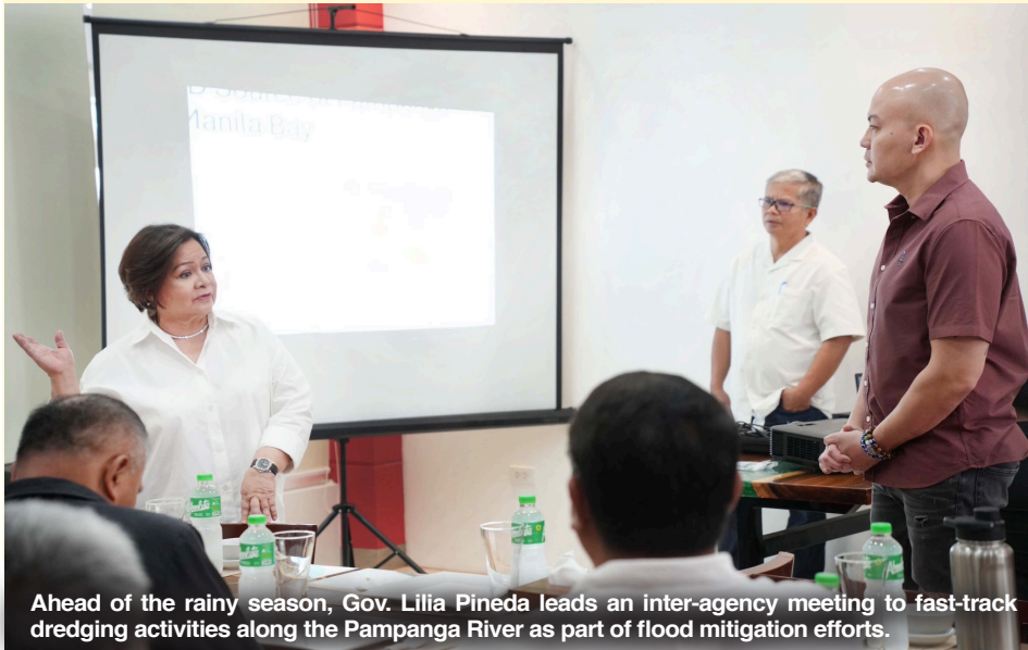
Ahead of the rainy season, Gov. Lilia Pineda leads an inter-agency meeting to fast-track dredging activities along the Pampanga River as part of flood mitigation efforts.