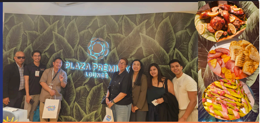
Plaza Premium Lounge: When waiting becomes a sweet treat P6