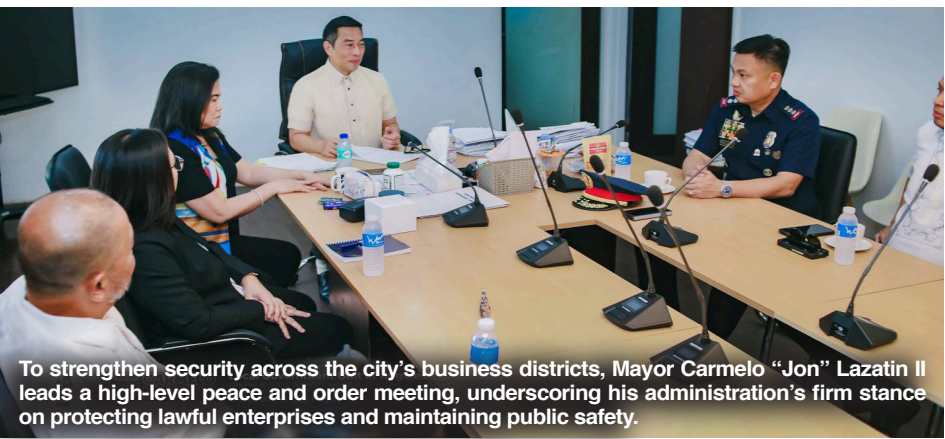
To strengthen security across the city’s business districts, Mayor Carmelo “Jon” Lazatin II leads a high-level peace and order meeting, underscoring his administration’s firm stance on protecting lawful enterprises and maintaining public safety.