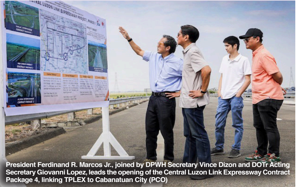
President Ferdinand R. Marcos Jr., joined by DPWH Secretary Vince Dizon and DOTr Acting Secretary Giovanni Lopez, leads the opening of the Central Luzon Link Expressway Contract Package 4, linking TPLEX to Cabanatuan City