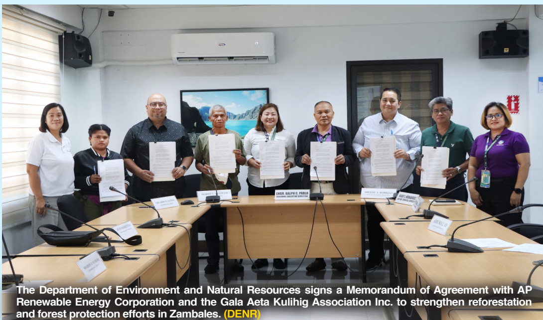
The Department of Environment and Natural Resources signs a Memorandum of Agreement with AP Renewable Energy Corporation and the Gala Aeta Kuliwig Association Inc. to strengthen reforestation and forest protection efforts in Zambales.