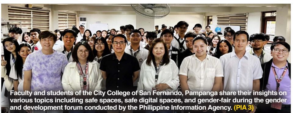
Faculty and students of the City College of San Fernando, Pampanga share their insights on various topics including safe spaces, safe digital spaces, and gender-fair during the gender and development forum conducted by the Philippine Information Agency.