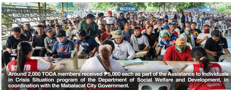
Around 2,000 TODA members received ₱5,000 each as part of the Assistance to Individuals in Crisis Situation program of the Department of Social Welfare and Development, in coordination with the Mabalacat City Government.

Mayor Aquino noted that the program provides significant help to beneficiaries, especially drivers affected by rising fuel costs, and added that the city government plans to provide additional assistance to TODA members in the coming weeks.