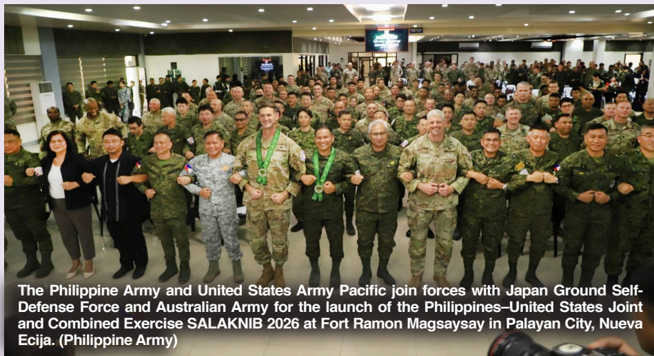
The Philippine Army and United States Army Pacific join forces with Japan Ground Self-Defense Force and Australian Army for the launch of the Philippines–United States Joint and Combined Exercise SALAKNIB 2026 at Fort Ramon Magsaysay in Palayan City, Nueva Ecija.

The multilateral exercises cover maritime and territorial defense, humanitarian assistance and disaster response, as well as amphibious and combined arms operations.