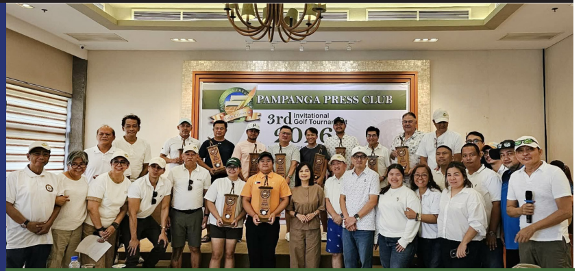
PPC Golf Tourney Powers Journalism Programs Forward P6