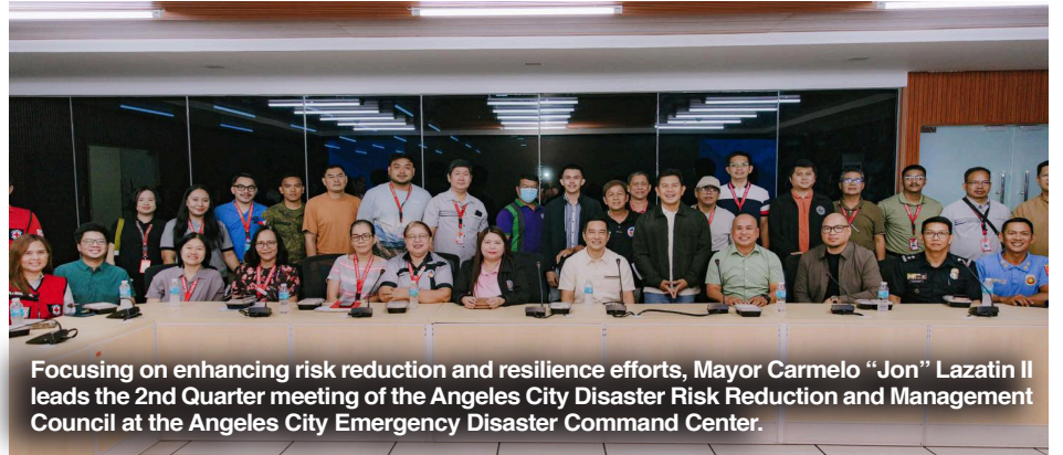
Focusing on enhancing risk reduction and resilience efforts, Mayor Carmelo "Jon" Lazatin II leads the 2nd Quarter meeting of the Angeles City Disaster Risk Reduction and Management Council at the Angeles City Emergency Disaster Command Center.

Under the Angeles City DRRM Plan 2026–2028, the city government continues to promote proactive, inclusive, and resilience-driven governance to ensure the safety and well-being of all Angelesños.