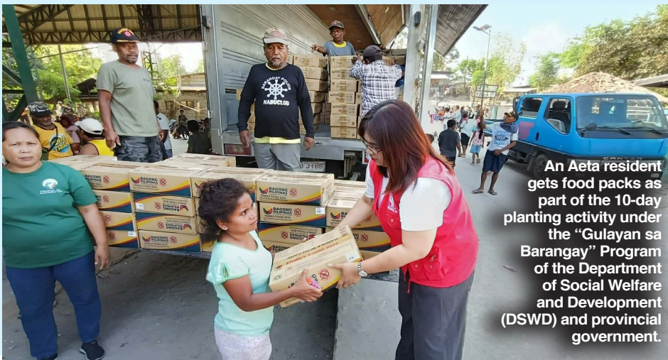
An Aeta resident gets food packs as part of the 10-day planting activity under the "Gulayan sa Barangay" Program of the Department of Social Welfare and Development (DSWD) and provincial government.

The activity forms part of the agency's Food-for-Work Program, which aims to provide assistance and support to Aeta communities, particularly amid rising market prices and ongoing economic challenges.