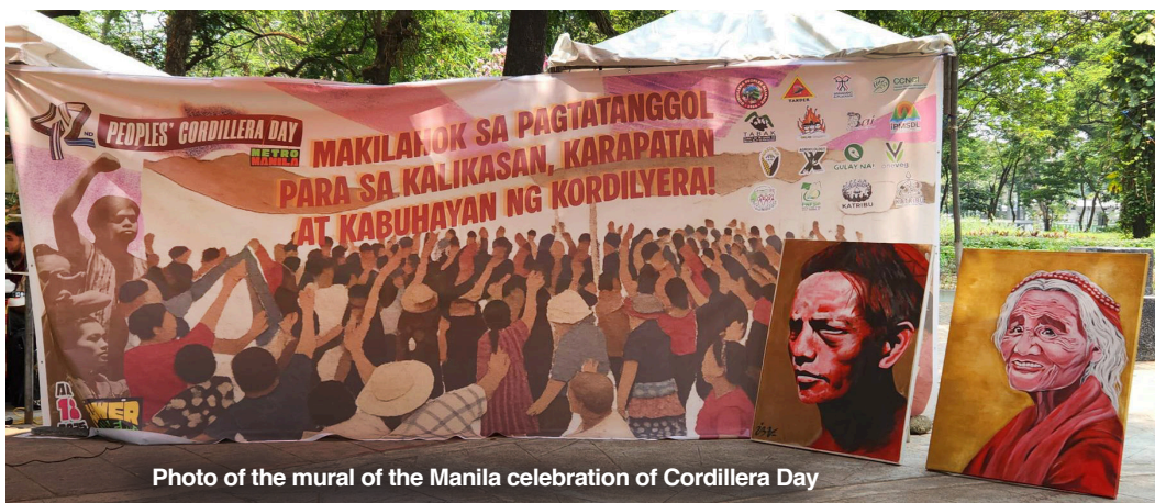
Photo of the mural of the Manila celebration of Cordillera Day