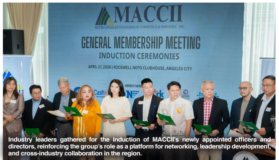
Industry leaders gathered for the induction of MACCII’s newly appointed officers and directors, reinforcing the group’s role as a platform for networking, leadership development, and cross-industry collaboration in the region.

JDN Realty Group said its participation reflects its sustained commitment to supporting initiatives that foster business linkages and contribute to regional economic growth.