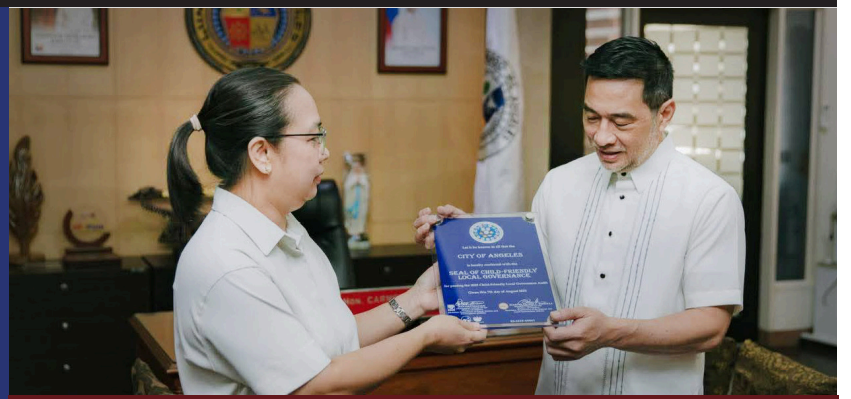
AC gets Seal of Child-Friendly Local Governance