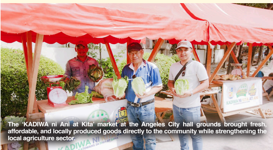
The 'KADIWA ni Ani at Kita' market at the Angeles City hall grounds brought fresh, affordable, and locally produced goods directly to the community while strengthening the local agriculture sector.

are agricultural products from the Municipality of Bokod, including cauliflower, Chinese cabbage (wombok), and cabbage, offered directly to consumers to ensure freshness and affordability. Officials emphasized that every purchase directly supports local farmers and small businesses, encouraging residents to continue patronizing homegrown products.