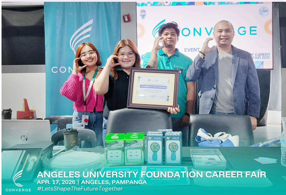
ANGELES UNIVERSITY FOUNDATION CAREER FAIR APR. 17, 2026 | ANGELES, PAMPANGA

The initiative also opened doors for near-graduates to explore career opportunities in data infrastructure, operations, and corporate roles nationwide, as part of the company's broader expansion in the digital sector.