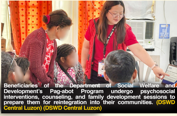
Beneficiaries of the Department of Social Welfare and Development's Pag-abot Program undergo psychosocial interventions, counseling, and family development sessions to prepare them for reintegration into their communities.

While formal impact assessments are still ongoing, DSWD considers the program, effective when beneficiaries remain off