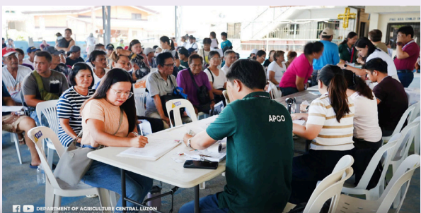
The Department of Agriculture distributes P2,325 cash assistance to farmers and fisherfolk in Bataan's 3rd District, covering the municipalities of Bagac, Dinalupihan, Morong, and Mariveles, under the Presidential Assistance for Farmers and Fisherfolk Program. (DA)

The PAFFP aims to provide immediate relief to farmers and fisherfolk as they cope with production challenges while supporting efforts to sustain food production and rural livelihoods.