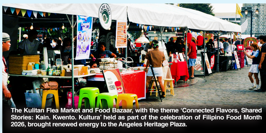
The Kulitan Flea Market and Food Bazaar, with the theme 'Connected Flavors, Shared Stories: Kain. Kwento. Kultura' held as part of the celebration of Filipino Food Month 2026, brought renewed energy to the Angeles Heritage Plaza.

the creativity and talent of food entrepreneurs and artists, turning the plaza into a vibrant space for culture and community. The event not only promoted local products and culinary traditions but also fostered a sense of connection among attendees, reinforcing Angeles City's role as a hub for culture, food, and shared experiences in Central Luzon.