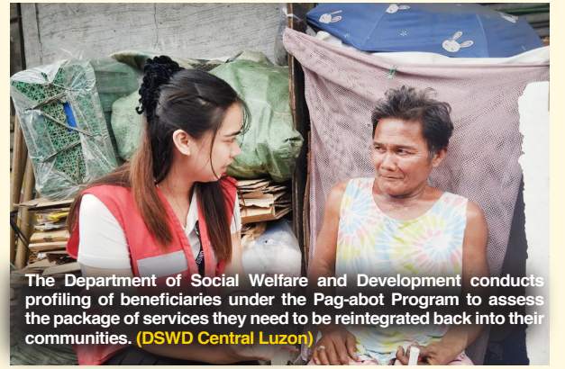
The Department of Social Welfare and Development conducts profiling of beneficiaries under the Pag-abot Program to assess the package of services they need to be reintegrated back into their communities.

the streets and are able to maintain safer, more stable lives.