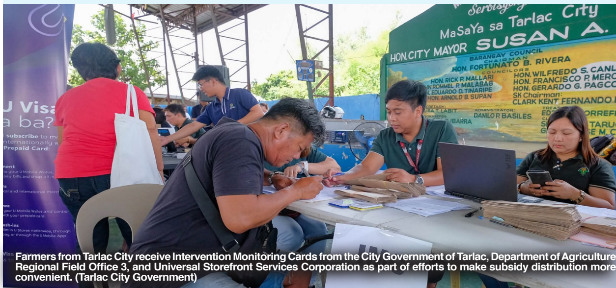
Farmers from Tarlac City receive Intervention Monitoring Cards from the City Government of Tarlac, Department of Agriculture Regional Field Office 3, and Universal Storefront Services Corporation as part of efforts to make subsidy distribution more convenient.

The initiative underscores the government's continued effort to reinforce its support for farmers, aiming for more stable food production and improved livelihoods in the agricultural sector.