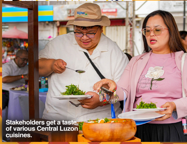
Stakeholders get a taste of various Central Luzon cuisines.

In Central Luzon, food is more than what is served on the table. It is a story of people, place, and opportunity.