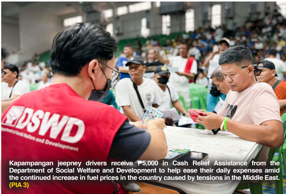
Kapampangan jeepney drivers receive ₱5,000 in Cash Relief Assistance from the Department of Social Welfare and Development to help ease their daily expenses amid the continued increase in fuel prices in the country caused by tensions in the Middle East.