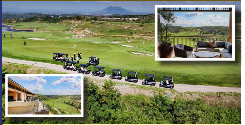
An exclusive look at Hann Reserve: Central Luzon's premier eco sanctuary