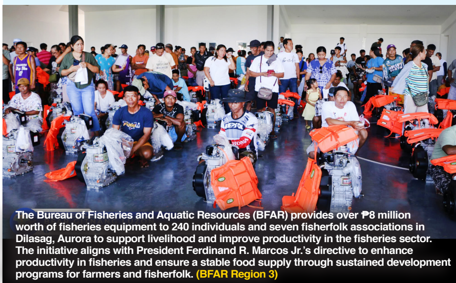
The Bureau of Fisheries and Aquatic Resources (BFAR) provides over ₱8 million worth of fisheries equipment to 240 individuals and seven fisherfolk associations in Dilasag, Aurora to support livelihood and improve productivity in the fisheries sector. The initiative aligns with President Ferdinand R. Marcos Jr.’s directive to enhance productivity in fisheries and ensure a stable food supply through sustained development programs for farmers and fisherfolk.

Through these interventions, fisherfolk in Aurora are expected to strengthen their livelihoods and develop more resilient, sustainable income sources over the long term.