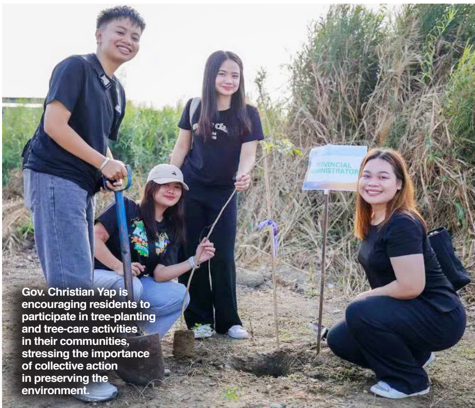
Gov. Christian Yap is encouraging residents to participate in tree-planting and tree-care activities in their communities, stressing the importance of collective action in preserving the environment.

Yap also expressed hope that the annual celebration would inspire greater environmental awareness and strengthen public commitment to protecting nature.