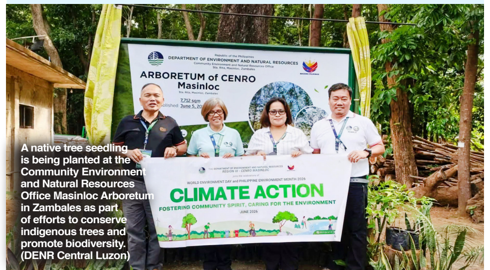
A native tree seedling is being planted at the Community Environment and Natural Resources Office Masinloc Arboretum in Zambales as part of efforts to conserve indigenous trees and promote biodiversity.

The arboretum supports the environmental priorities of the administration of President Ferdinand R. Marcos Jr., which include biodiversity conservation, reforestation, and sustainable natural resource management.