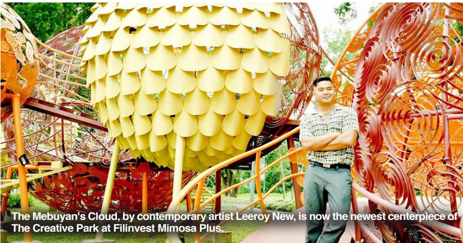
The Mebuyan's Cloud, by contemporary artist Leeroy New, is now the newest centerpiece of The Creative Park at Filinvest Mimosa Plus.

The installation further strengthens Filinvest Mimosa Plus' vision of integrating art and culture into everyday life, offering visitors a new cultural landmark to experience in Clark.