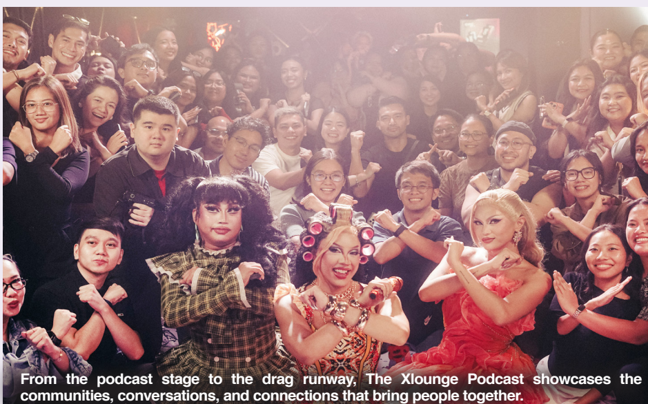
From the podcast stage to the drag runway, The XLounge Podcast showcases the communities, conversations, and connections that bring people together.