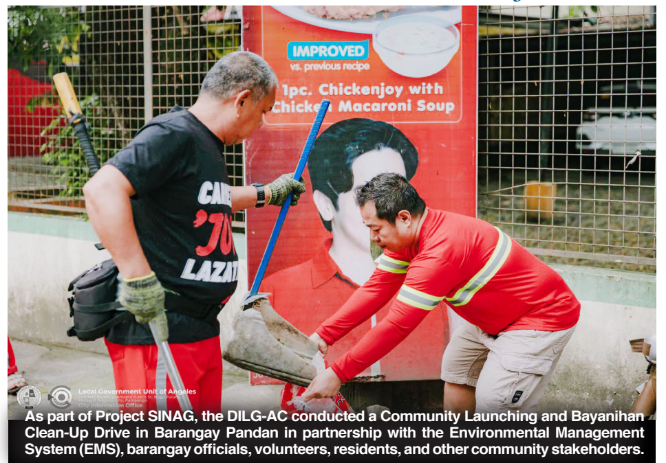
As part of Project SINAG, the DILG-AC conducted a Community Launching and Bayanihan Clean-Up Drive in Barangay Pandan in partnership with the Environmental Management System (EMS), barangay officials, volunteers, residents, and other community stakeholders.