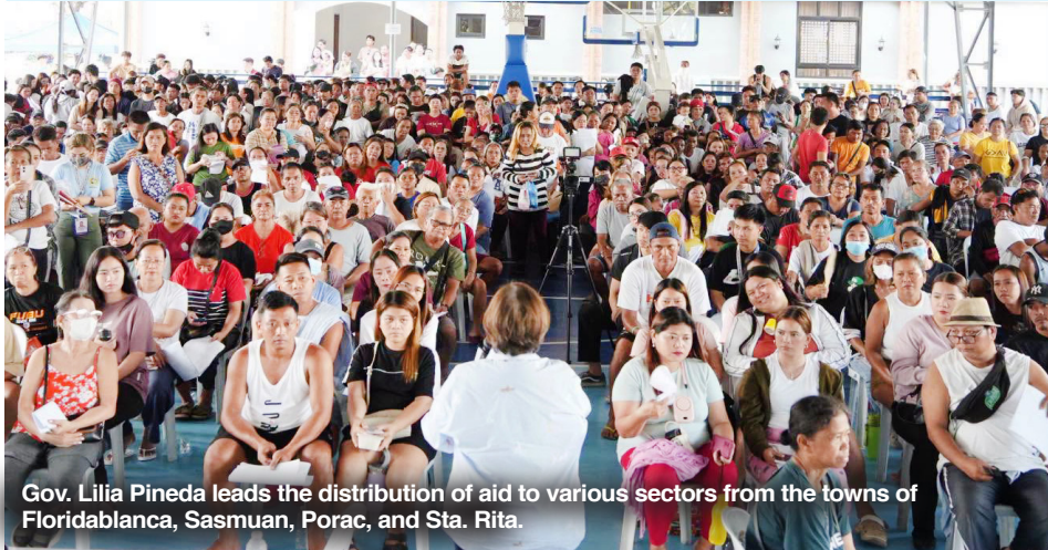
Gov. Lilia Pineda leads the distribution of aid to various sectors from the towns of Floridablanca, Sasmuan, Porac, and Sta. Rita.

Beneficiaries expressed gratitude for the continued support from the government, with many citing the assistance as a valuable help in meeting their daily needs.