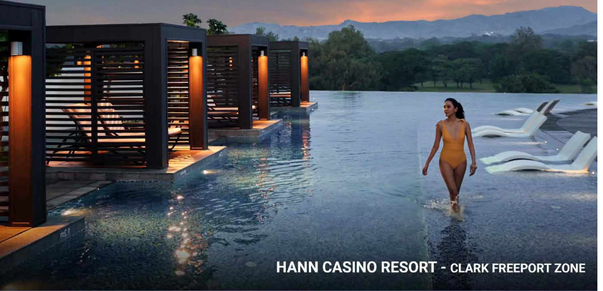
HANN CASINO RESORT - CLARK FREEPORT ZONE