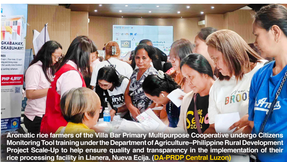
Aromatic rice farmers of the Villa Bar Primary Multipurpose Cooperative undergo Citizens Monitoring Tool training under the Department of Agriculture–Philippine Rural Development Project Scale-Up to help ensure quality and transparency in the implementation of their rice processing facility in Llanera, Nueva Ecija. (DA-PRDP Central Luzon)