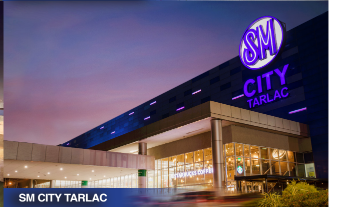
SM CITY TARLAC