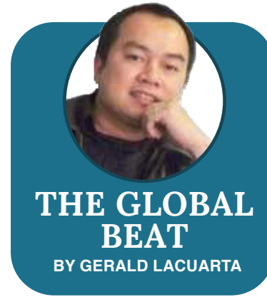
THE GLOBAL BEAT