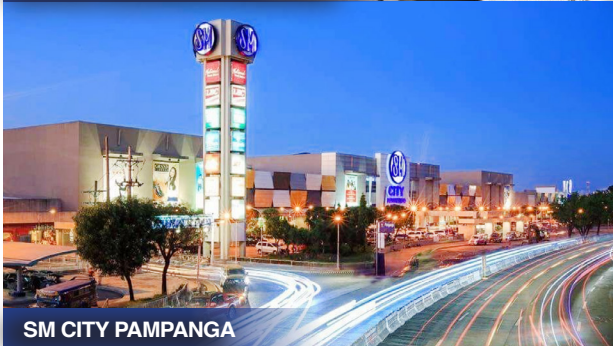
SM CITY PAMPANGA