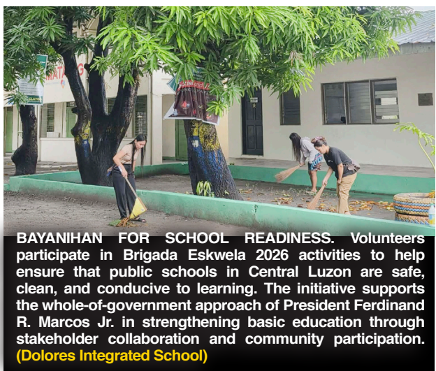
BAYANIHAN FOR SCHOOL READINESS. Volunteers participate in Brigada Eskwela 2026 activities to help ensure that public schools in Central Luzon are safe, clean, and conducive to learning. The initiative supports the whole-of-government approach of President Ferdinand R. Marcos Jr. in strengthening basic education through stakeholder collaboration and community participation.

With sustained collaboration expected throughout the implementation period, Brigada Eskwela continues to serve as a key platform for advancing quality education and reinforcing community involvement in the region.