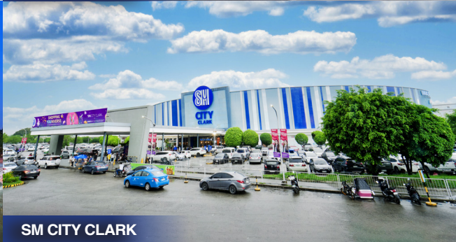
SM CITY CLARK