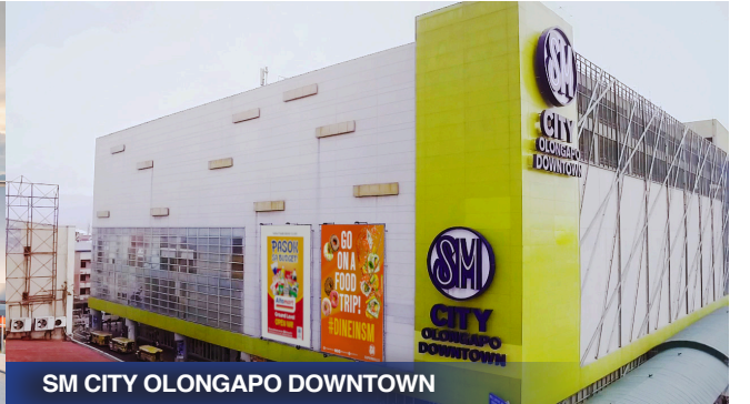
SM CITY OLONGAPO DOWNTOWN