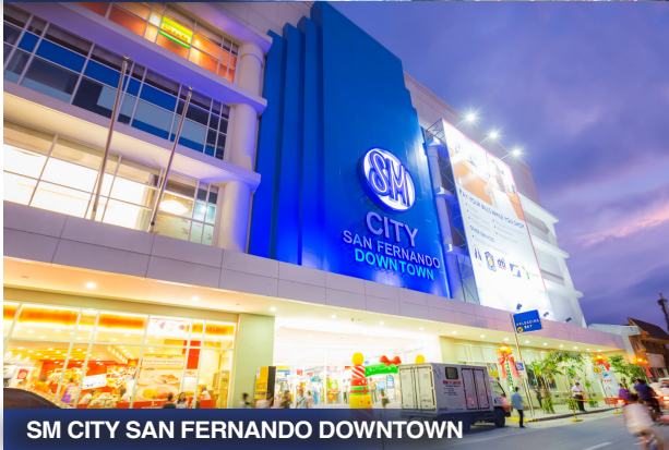
SM CITY SAN FERNANDO DOWNTOWN