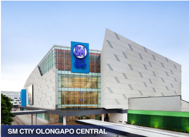
SM CITY OLONGAPO CENTRAL