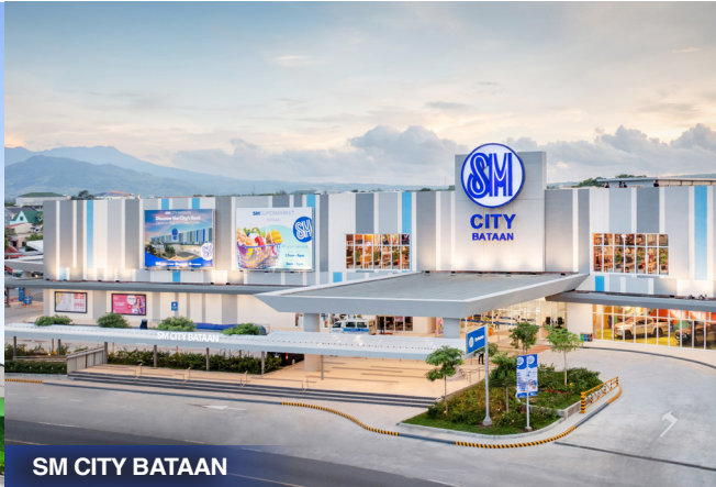
SM CITY BATAAN