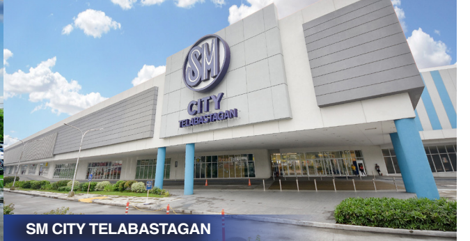
SM CITY TELABASTAGAN