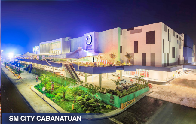
SM CITY CABANATUAN